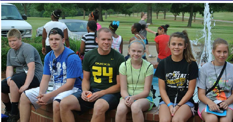
HUMC Youth at Extreme Camp 2013, Garden Valley, Texas